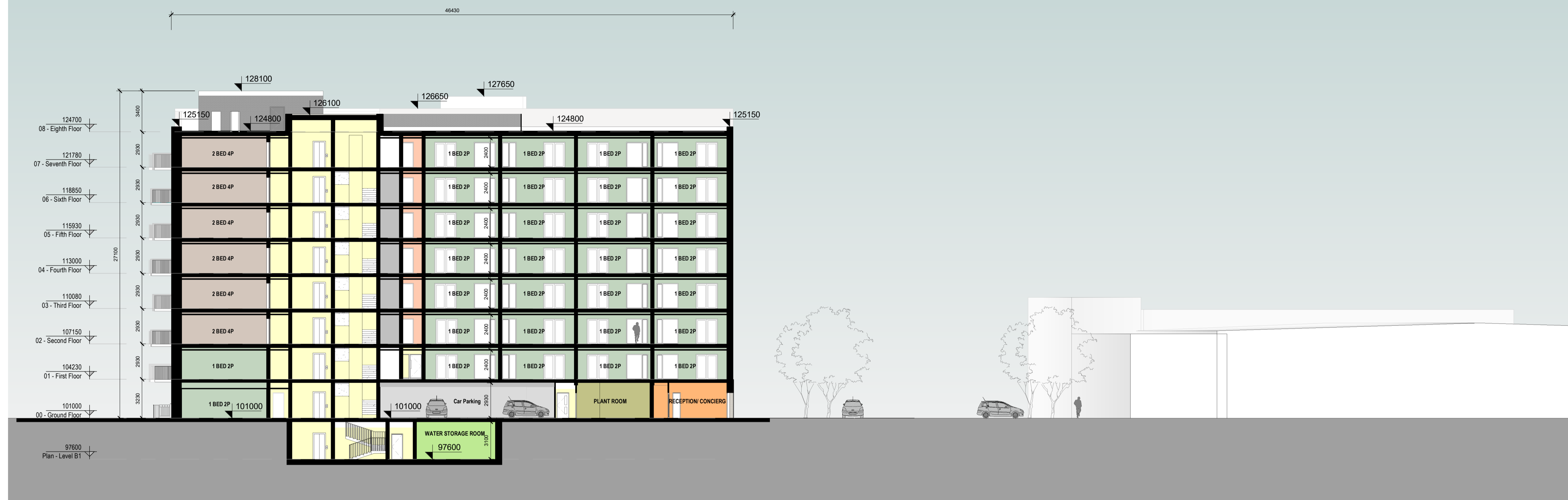
D1 Block D - Section D1