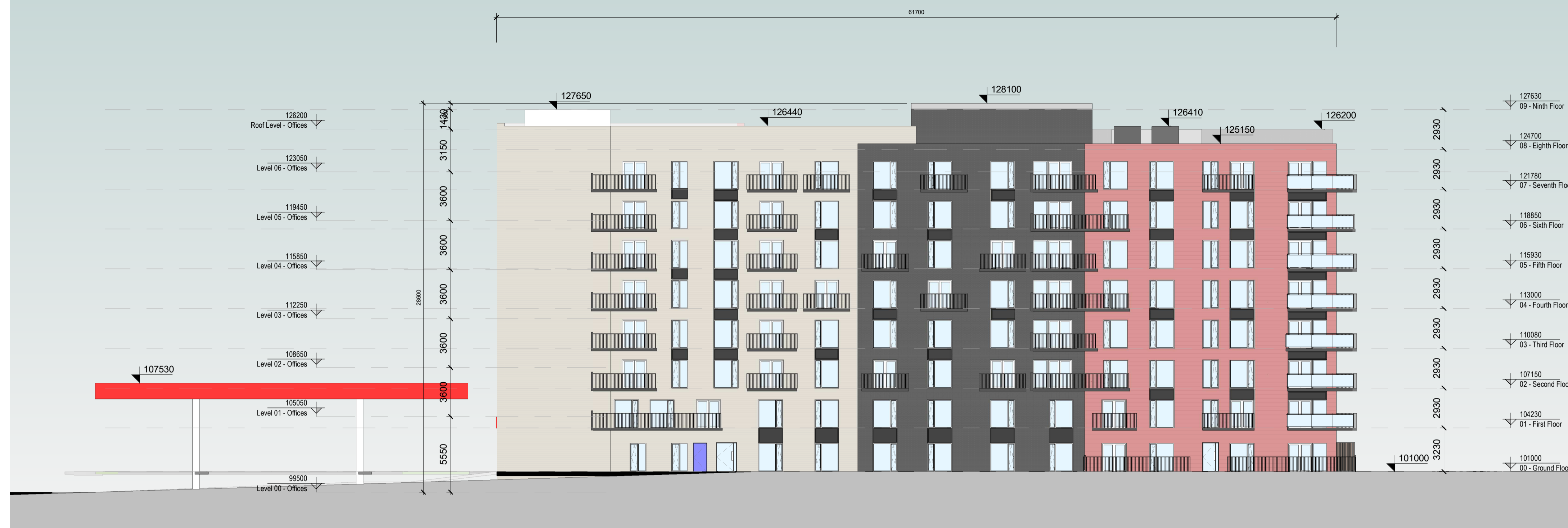
D3 Block D - Elevation D3