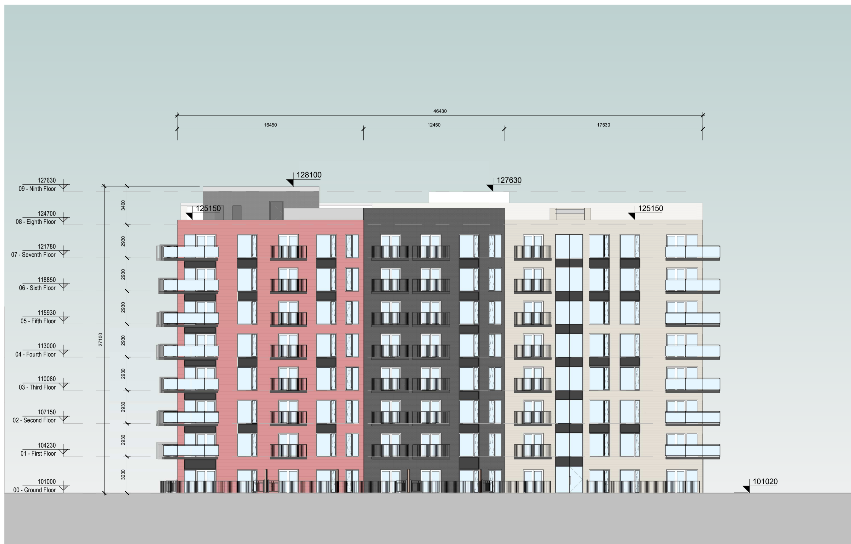
D2 Block D - Elevation D2

1 Sarsfield Quay, Arbour Hill, Dublin 7 t: 01 518 0170 e: admin@cwoarchitects.ie Dublin | London | Warwick | Manchester www.cwoarchitects.ie