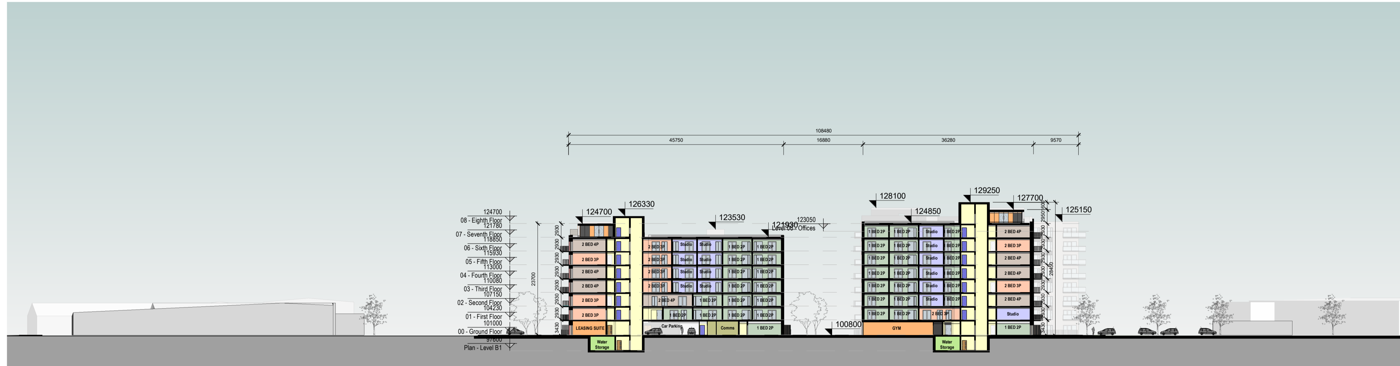
E Contextual Section E 1:500