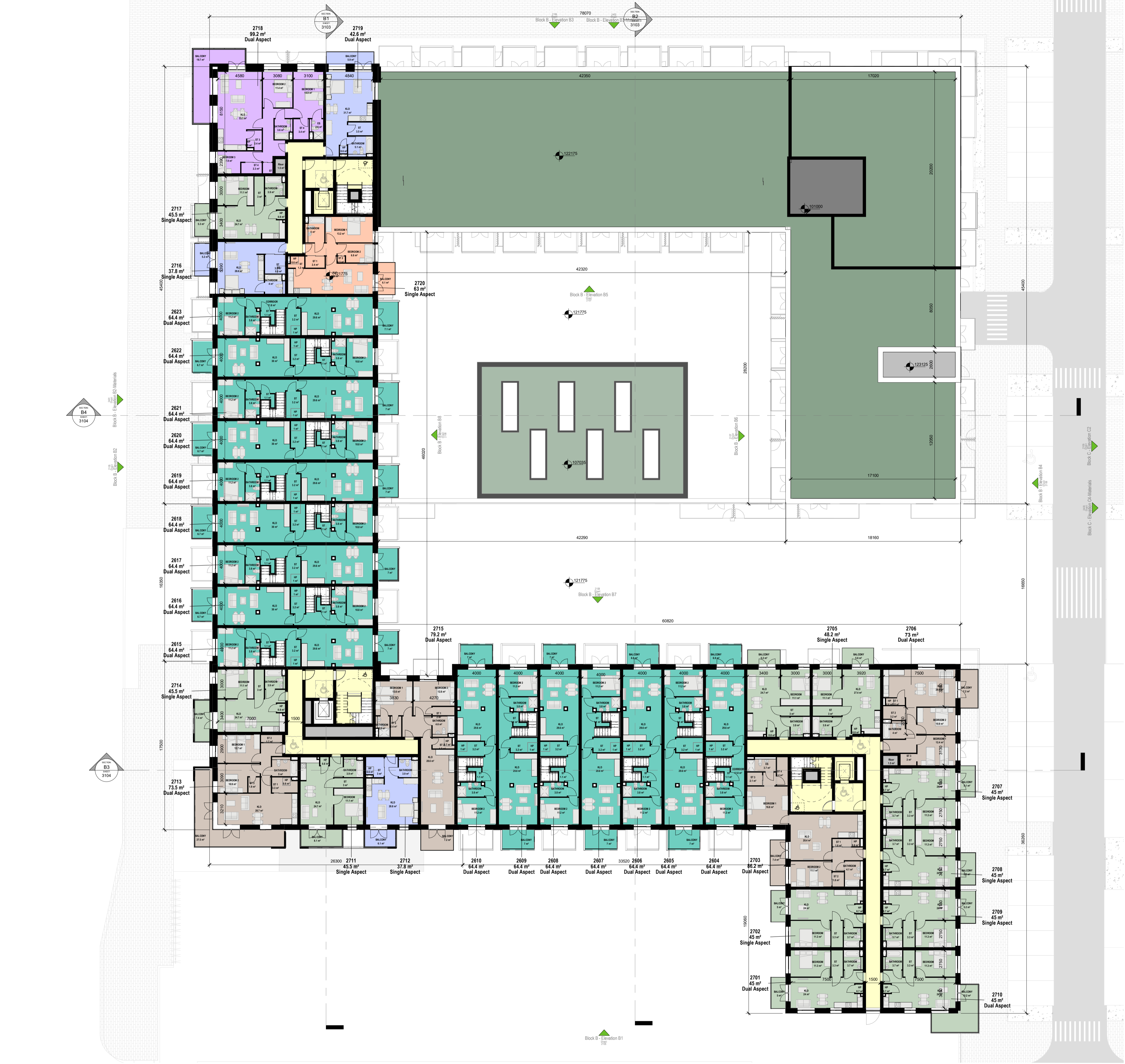
1 Plan - Block B - Level 07 1 : 200

Please consider the environment before printing this sheet